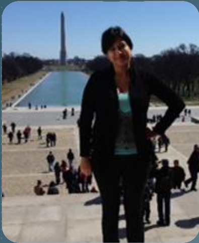
"I have a dream" - Martin Luther King Jr.