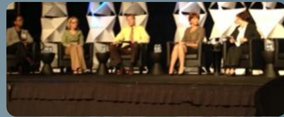
Panel of Judges