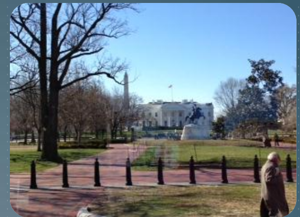
The White House