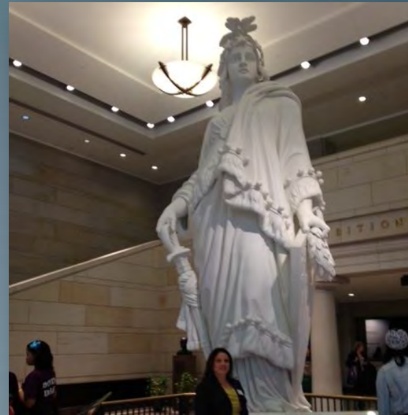
Statue of Lady Liberty in the State Capital of Washington D.C