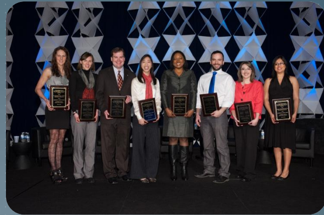
All the Awardee's