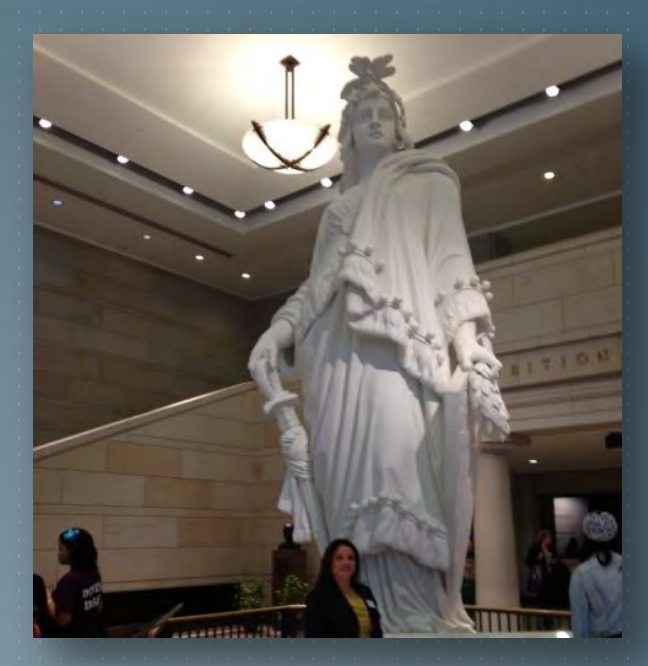
Statue of Lady Liberty in the State Capital of Washington D.C