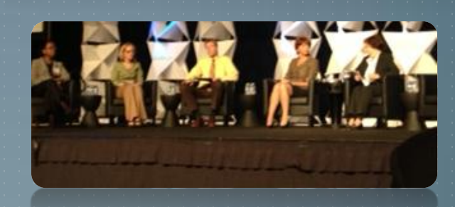
Panel of Judges