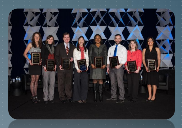
All the Awardee's